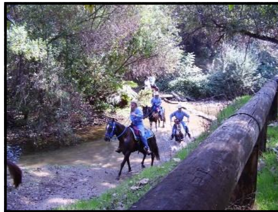
One of 13 water crossings in the Walnut Creek area.